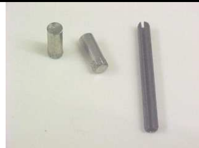
P315-PIN KIT PIN & SCREW KIT