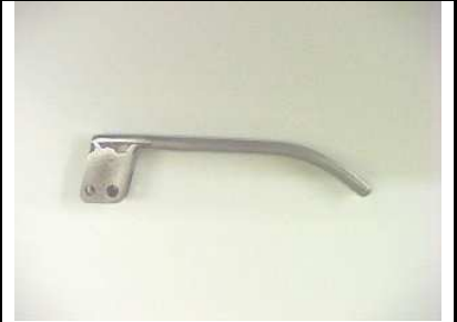
P315-0824 TRIGGER 14