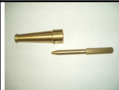
BRASS PUNCH JET ASSEMBLY 2