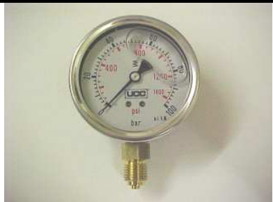
E315-0696 (OPTION) PRESSURE GAUGE