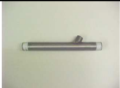
P315-0108 (OPTION) TIP PRESSURE GAUGE