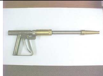
E315-0194 WASHGUN 19