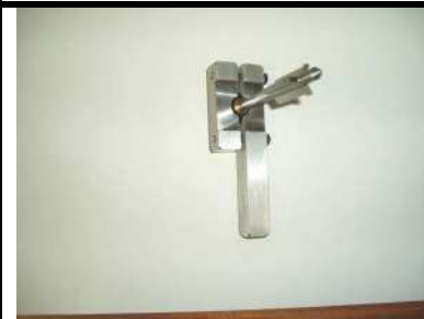
CLAMP 5 IN ACTION