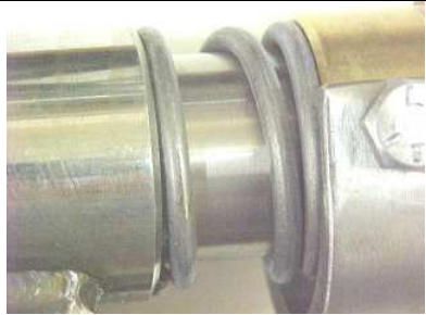
P315-0196 INSERT 9