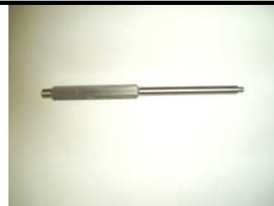
STEEL PUNCH FOR 1/4" JET 3