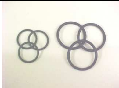
P315-OKIT O RING KIT