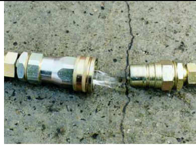
P315-0823 QUICK COUPLER 18