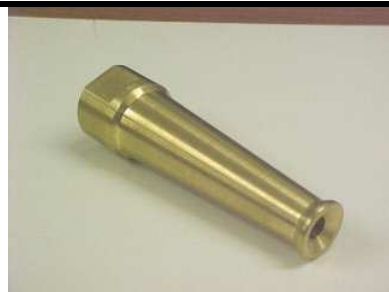
E315-0693 NOZZLE ASSY 1/4"