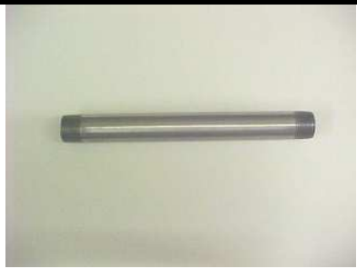
P310-0108 TIP EXTENSION 2