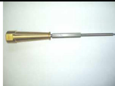
PUNCH 1 & 3 IN ACTION