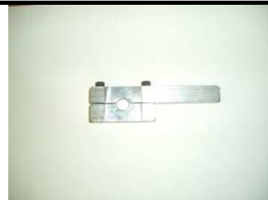
DEFLECTOR DART CLAMP 5