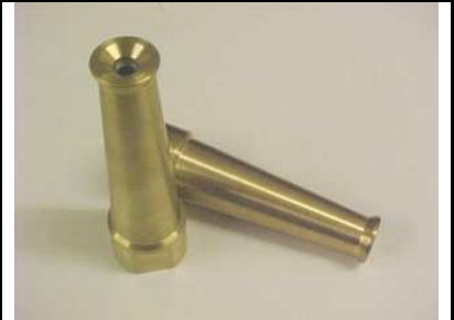
E315-0694 (OPTION) NOZZLE ASSY 5/16"