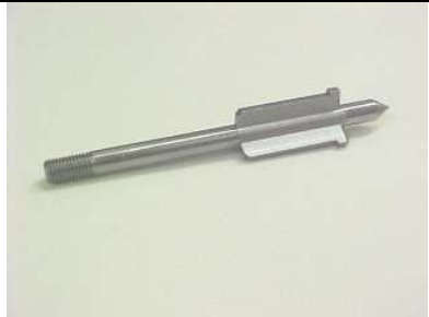
P315-0199 STEM 17