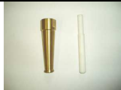
FLOW STRAIGHTENER PUNCH 6