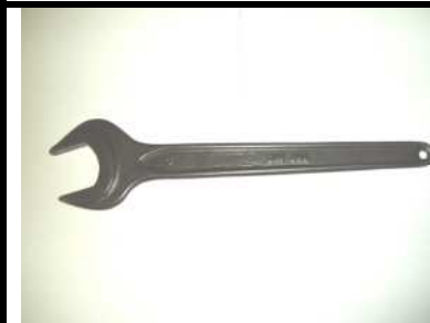
WASHGUN BODY SPANNER 4