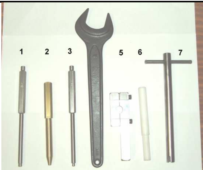
IW410044 - 7 PIECE WASH GUN TOOL REPAIR KIT