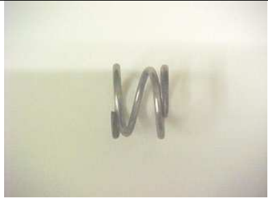
P315-0195 SPRING 8