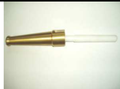
PUNCH 6 IN ACTION