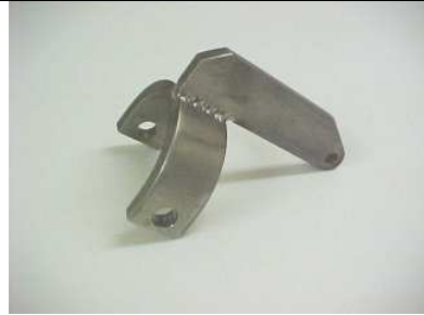
P315-0825 YOKE 10