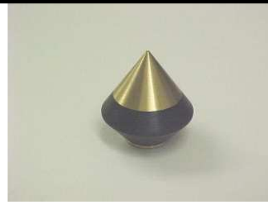
E315-0200 DEFLECTOR DART 4