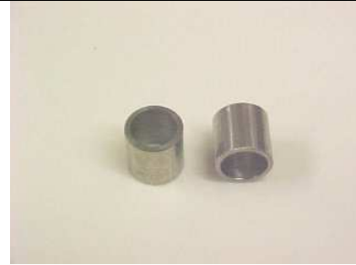
P315-0209 YOKE BUSHING 12