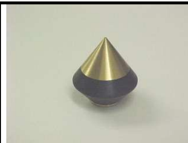
E315-0200 DEFLECTOR DART