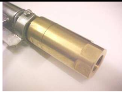
P315-0198 ADAPTOR 3