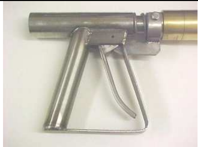
E315-0211 HOUSING 16