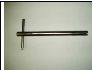
TEE WRENCH FOR DART STEM 7