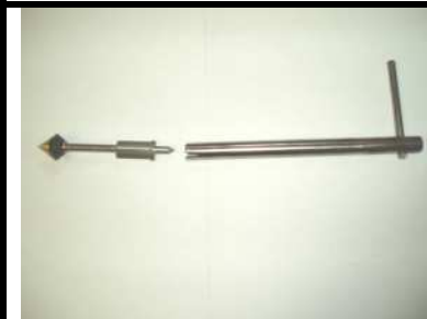
WRENCH 7 IN ACTION