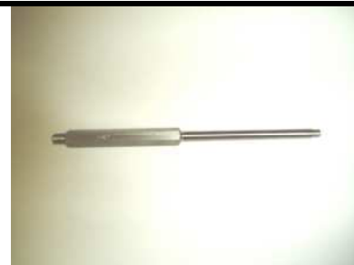
STEEL PUNCH FOR 5/16" JET 1