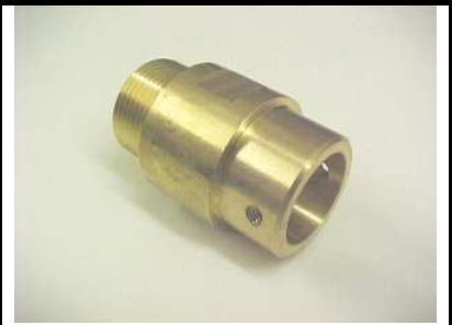
P315-0197 BODY 6